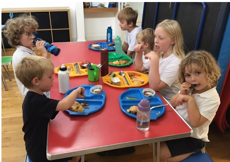
Buddies in action at lunch time

Our eldest children are buddying up with our new starters to ensure they all have the best of times during those early days at school. Thank you to our buddies for supporting this endeavour!