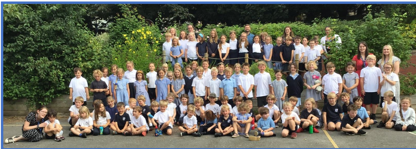
A great start to term!

I hope that they all enjoy their Landscope days whilst learning lots and playing full roles in the life of the school.